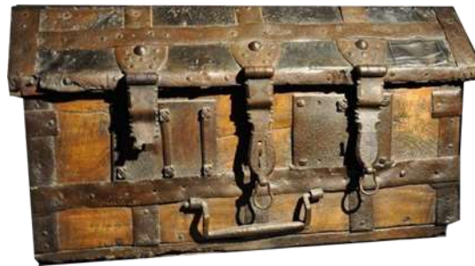
Fig 1 An ancient example of an organizer

Very wealthy people chose alabaster chests, and the ancient Greeks, who had ample access to wood, stored their clothes in chests. And the history of these closets and organizers goes back to Roman times, however, Roman soldiers, with the invention of armor, took the first step to invent modern closets and objects to organize their tools and weapons. A simple wooden box used to safely transport your weapons and armor from one camp to another. During most of the medieval period, this box became the boxes of elaborate silk clothes that were used by the rich to protect their expensive clothes from rats and moths that might destroy them. Over the next few hundred years, these chests gradually became armories (Aghakhani, 2007).