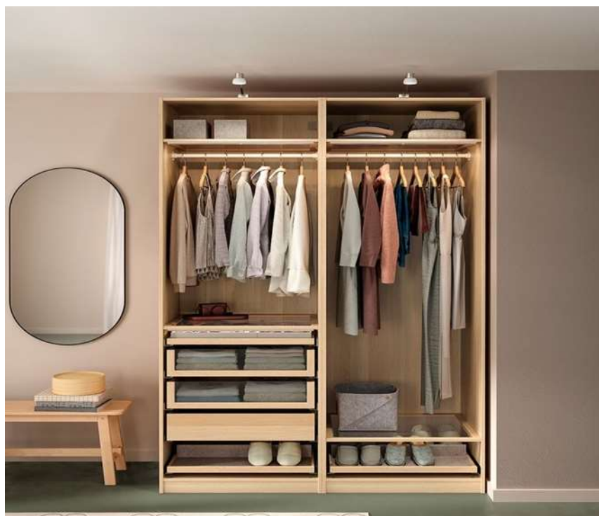
Fig 3 Newer organizer sample

In the 1870s, the hanger rod was first incorporated into wardrobes, and the first hangers soon followed. According to its original French definition, a wardrobe is a piece of furniture that protects clothes. It may also include drawers and mirrors. During the Middle Ages, these cabinets had beautifully designed works of art or carvings.