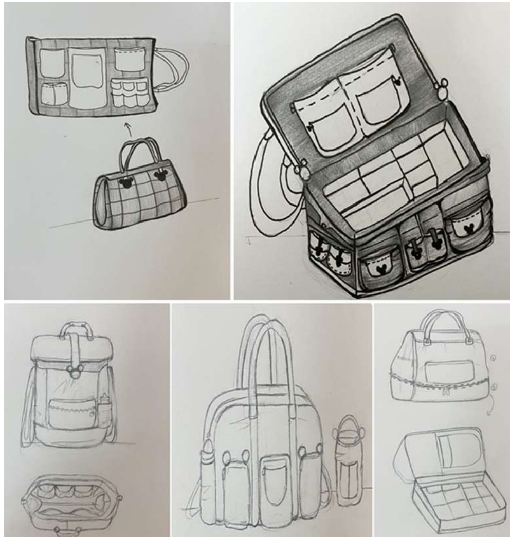
Fig 5 The initial sketches

were prepared by designing and taking into account the coloring, efficiency, elements such as the roots of the work, prominent texture, landscape designs and it was shown in the format of the storyboard; After creating a set of some linear etudes of design, selected designs were completed (Figures 5-6).