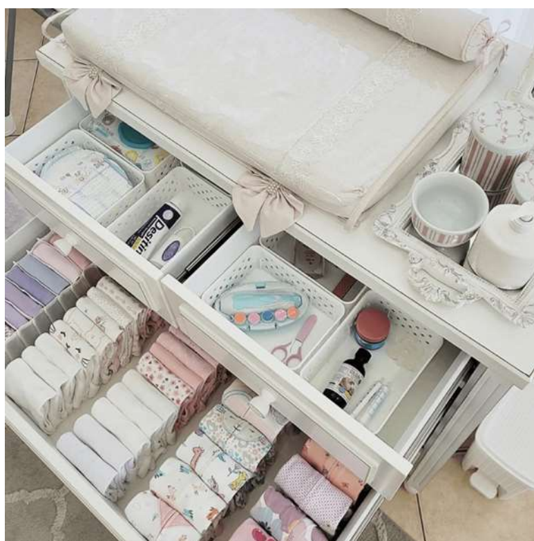
Fig 4 Organizer sample

clothes that do not need to be hung. And also hang the best clothes such as elegant blouses on hangers. These big and strong hangers help the clothes pieces to keep their shape in the warehouse. This type of sorting and using organizers is also very necessary for children's rooms. One of the key items in children's rooms is the closet, and keeping it organized can make a big difference in keeping a functional and clutter-free children's room. slow One of the most effective ways to organize a child's closet is to divide the drawers into categories and assign a specific category of children's items to each drawer. An easy way to ensure that all of the children's items have a place is to group them by type. For example, there may be a drawer for clothes, a drawer for diapers, and wet wipes, accessories... and they can also use organizers and organizers inside the drawer to allocate more space. This keeps children's things neat and tidy, and makes it easy to find what they need. Organize for children's items should have proper dividers and shelves to help children put toys, clothes, etc. This feature helps children to find the objects they need more easily and to maintain order and organization in their room (Dadkhah Tirani, Davodiroknabadi, and Zohoori, 2018; Soltani, Zohoori, and Davoodi Rokanabadi, 2022).