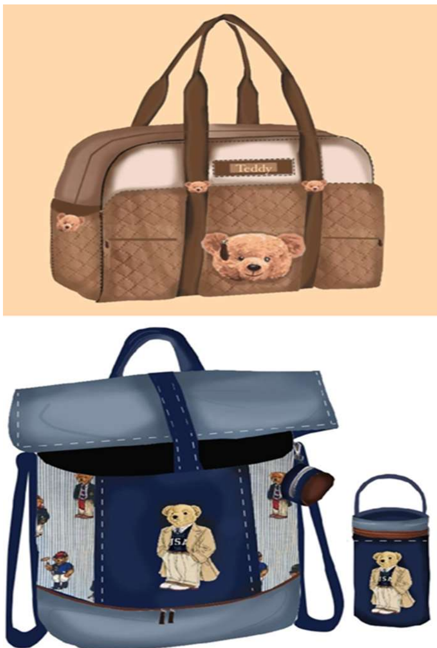
Fig 6 Final designs

In this type of design style, the baby bag can be used both as a backpack, which is more convenient for parents, and as a hand bag. And at the bottom, the bag can be separated using a zipper (for more space and order) and there is also a special place for a baby's pacifier like a key ring.